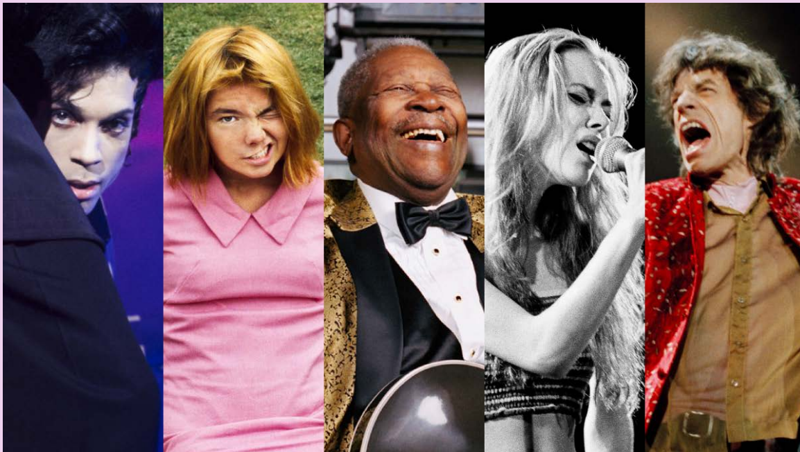
Left to right: Prince, Björk, B.B. King, Fiona Apple, and Mick Jagger

See your favorite musicians through the lens of a master photographer. RetroBlakesberg: The Music Never Stopped invites you to travel through some of the most explosive moments in music history, tracing the evolution of San Francisco's unique music culture and its wide-reaching influence through photographs of legendary musicians and performances. Click here to book tickets today!