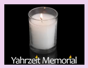
In October We Remember:

(There's another terrific (and different) Cabaret at Addison-Penzak JCC, Los Gatos, Sunday, October 22nd, 4:00p.m.-6:00p.m.)