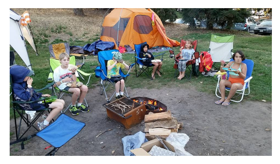
Camping in Petaluma. We had tacos, pancakes, s'mores, singing, swimming, and generally enjoying each other's company for a lovely weekend.